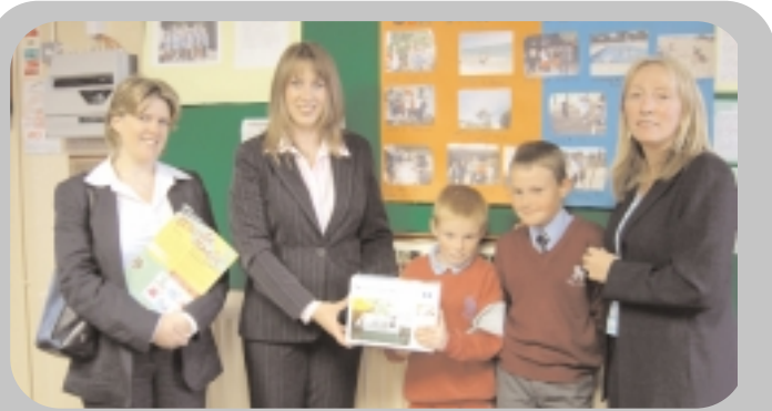
Congratulations to Scoil Eoin Ballincollig, winners of the APC Microbe Magic Gut Wordsearch Competition, pictured here being presented with a digital camera for their school.

Cancer occurs when cells grow too fast, resulting in the growth of tumours.